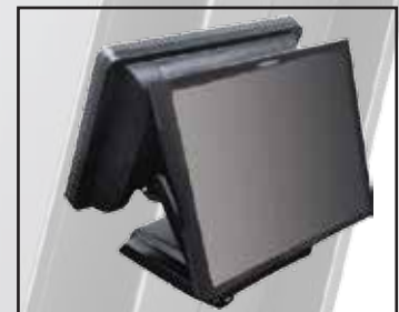
SP-800SP-800 with the 15" bezel free LCD (Optional)