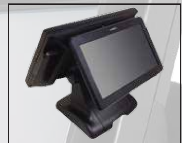
SP-800 with the 11.6" LCD