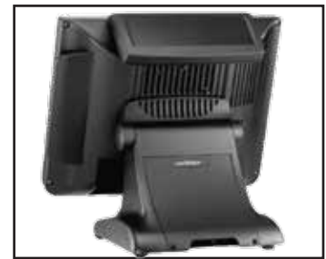
SP-800 with the 2x20 VFD