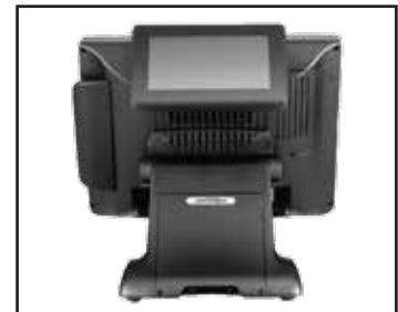
SP0800 with the 7" LCD