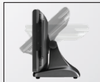
Wide Tilt Angle