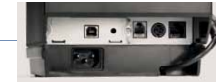
Exchangeable interfaces plus RJ-45 port