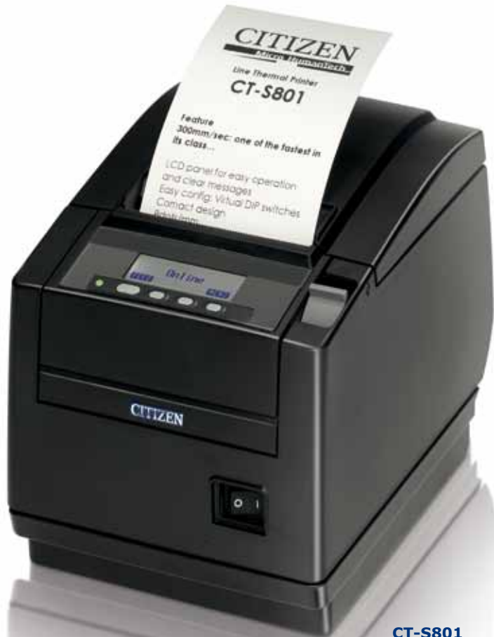
CT-S801 (available in black or white)