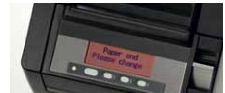
Error message with instruction